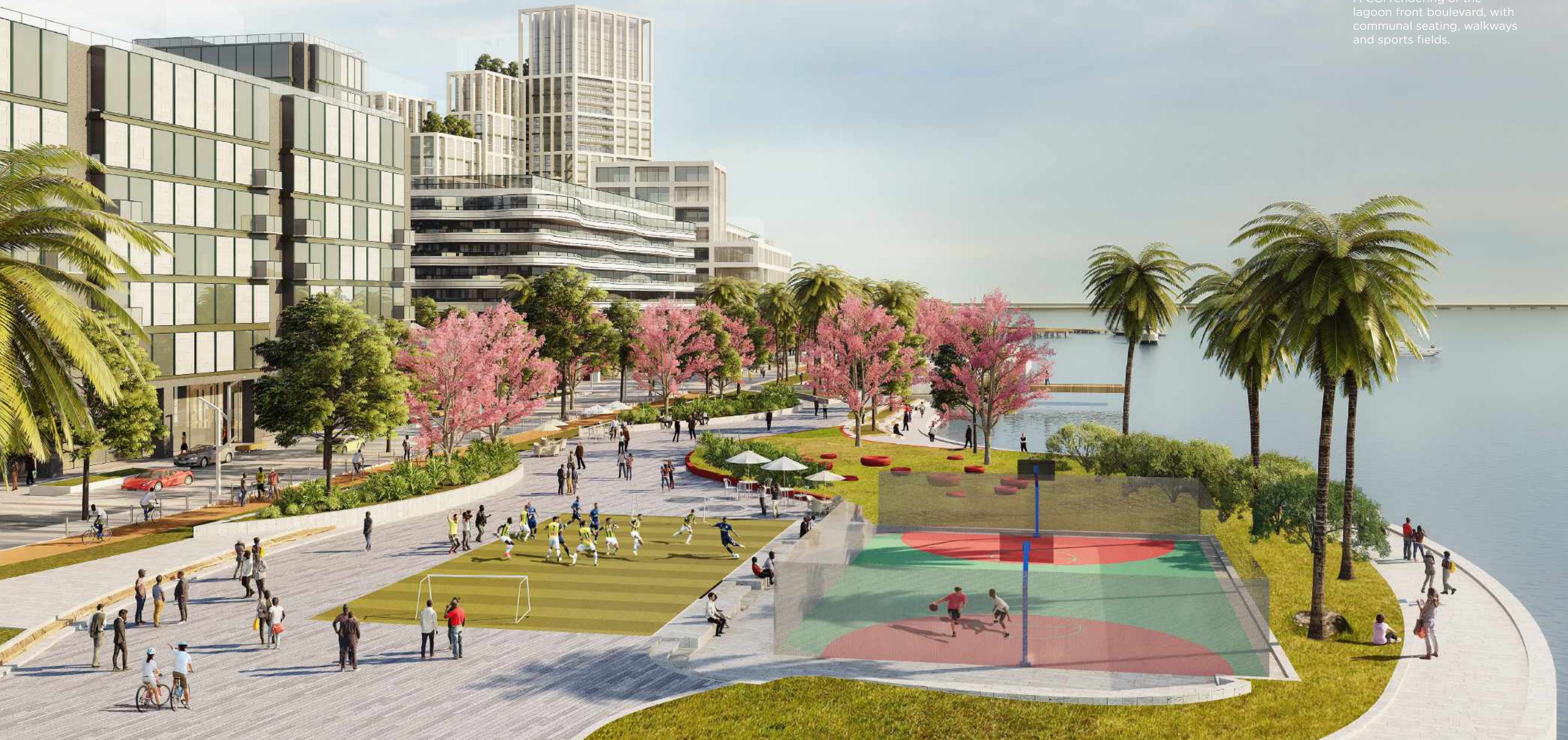
LAGOON DRIVE A CGI rendering of the lagoon front boulevard, with communal seating, walkways and sports fields.