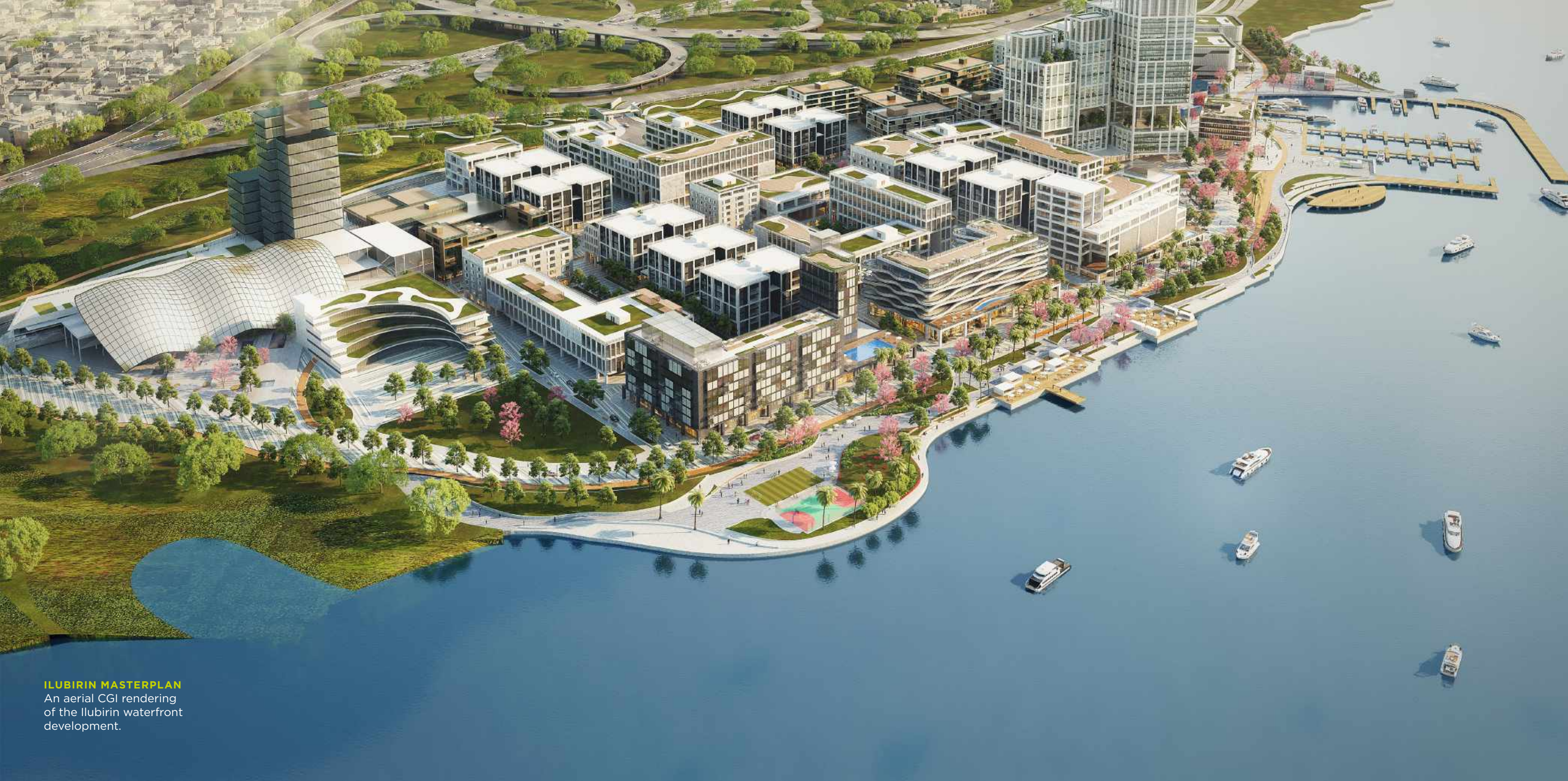
ILUBIRIN MASTERPLAN An aerial CGI rendering of the Ilubirin waterfront development.