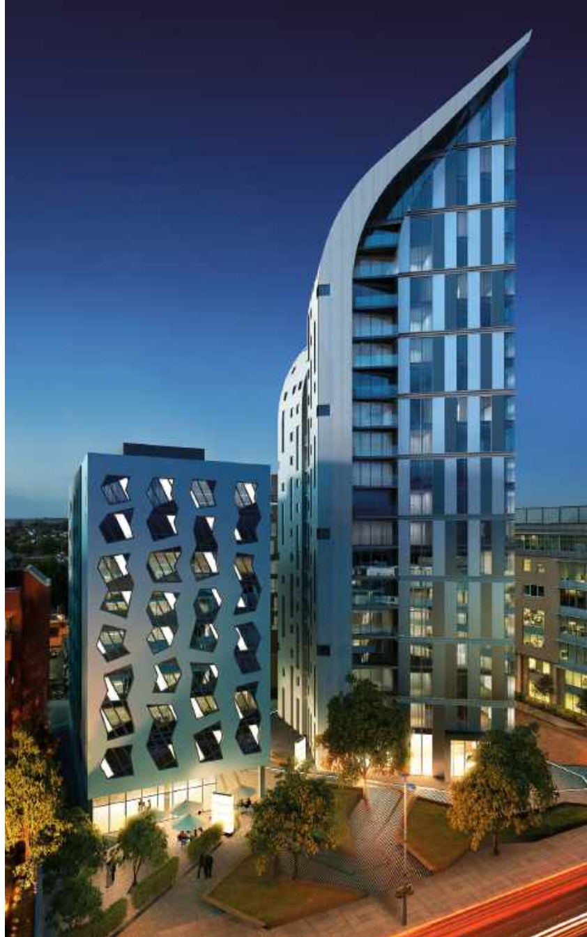
APEX High rise multi-residential and mix use building located in Ealing, London.