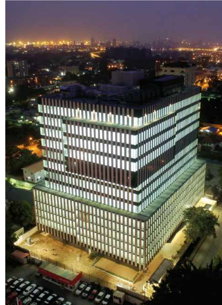
HERITAGE PLACE Designed by ECAD Architects in Association with Capita, located in Lagos, Nigeria.

With strong roots in South Africa and increased exposure to the global marketplace, 85% of SAOTA's clientele is now international with highly prestigious projects on six continents.