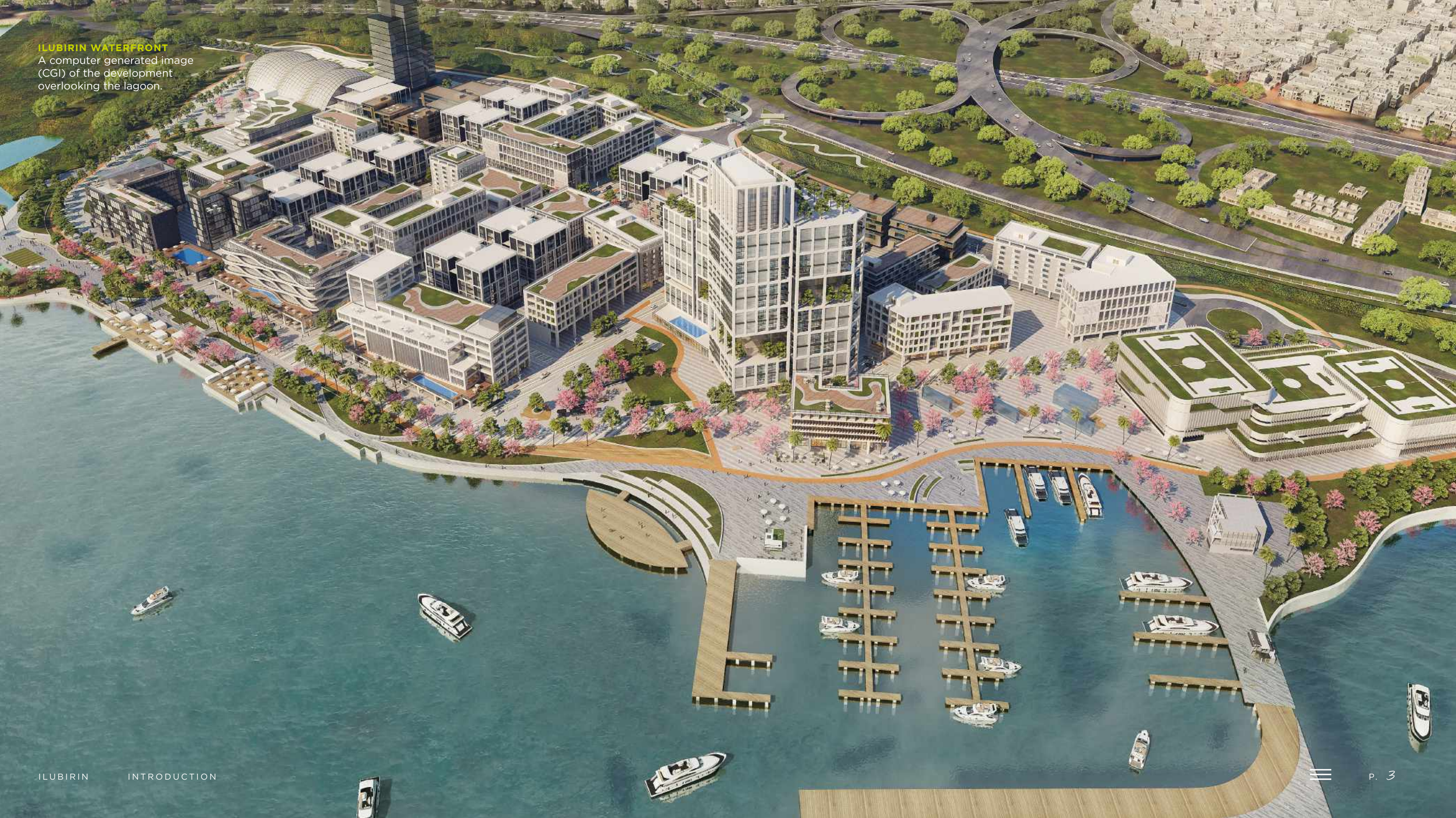
ILUBIRIN WATERFRONT A computer generated image (CGI) of the development overlooking the lagoon.